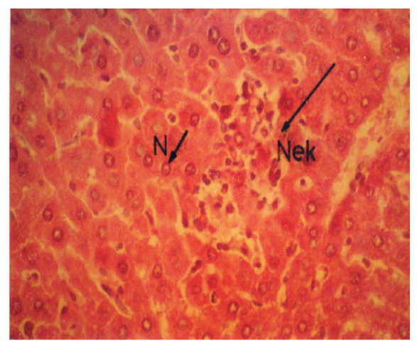
Figure 3. Liver tissues obtained from group II of Mus musculus albino mouse. (Hematoxylene-Eosin x200) NEK: necrosis of single cell, N: vesicular appearance in the nucleus of hepatocyte.